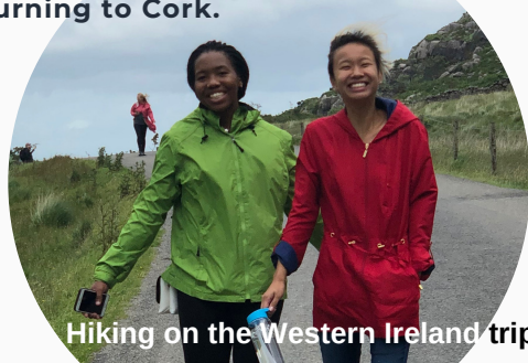
Hiking on the Western Ireland trip

For our second excursion, we will explore Western Ireland. Past participants have enjoyed two nights in Dingle and Galway with daytrips to Sleigh Head Peninsula and the breathtaking Cliffs of Moher before returning to Cork.