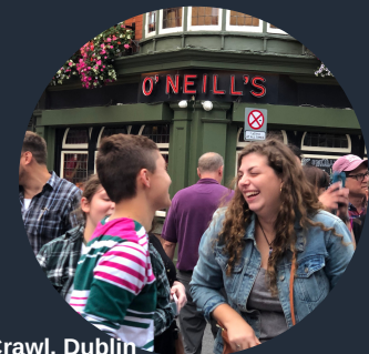
Literary Pub Crawl, Dublin

Participants will stay in apartment-style campus housing, with individual bedrooms and bathrooms, shared kitchens, and living rooms. These apartments are located a short walk from campus and with easy access to the Cork city center.