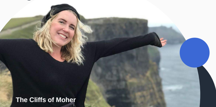
The Cliffs of Moher

The basic cost of the program is $4,695 for UNO students and $5,195 for guest participants. This includes the application fee, tuition for six credit hours, housing, transportation passes, study abroad health insurance; meals on class days; opening and closing receptions; readings, and performances by students, faculty, guest writers and readers. Financial awards and federal financial aid including consortium agreements are available.