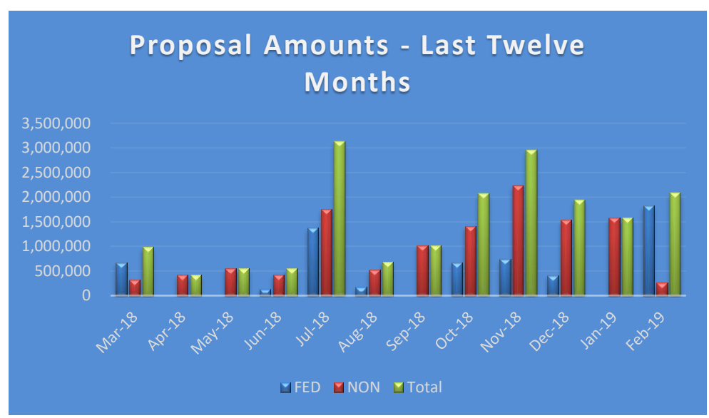
NOTE: Removed Medicaid amount ($111,576,092.40) from October 2018