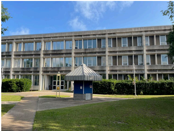
View from south facing north