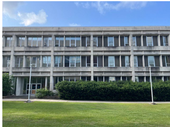
View from north facing south