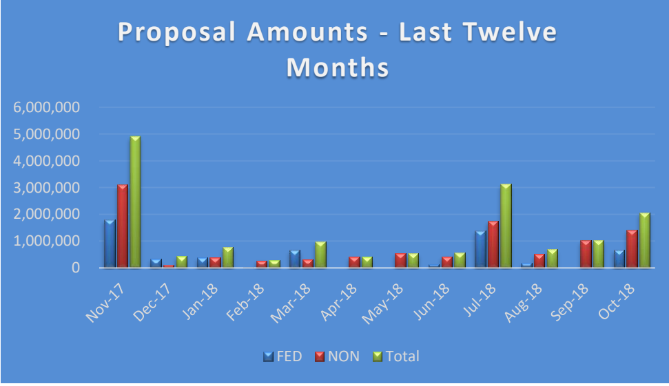
NOTE: Removed Medicaid amount ($111,576,092.40) from October 2018