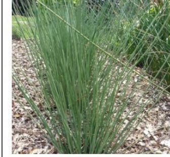
BLUE ARROW JUNCUS