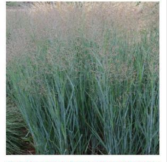
SWITCH GRASS 'HEAVY METAL'

These grasses feature a green understory layer which is outgrown by pink-purple flowers that have a feather-like quality.