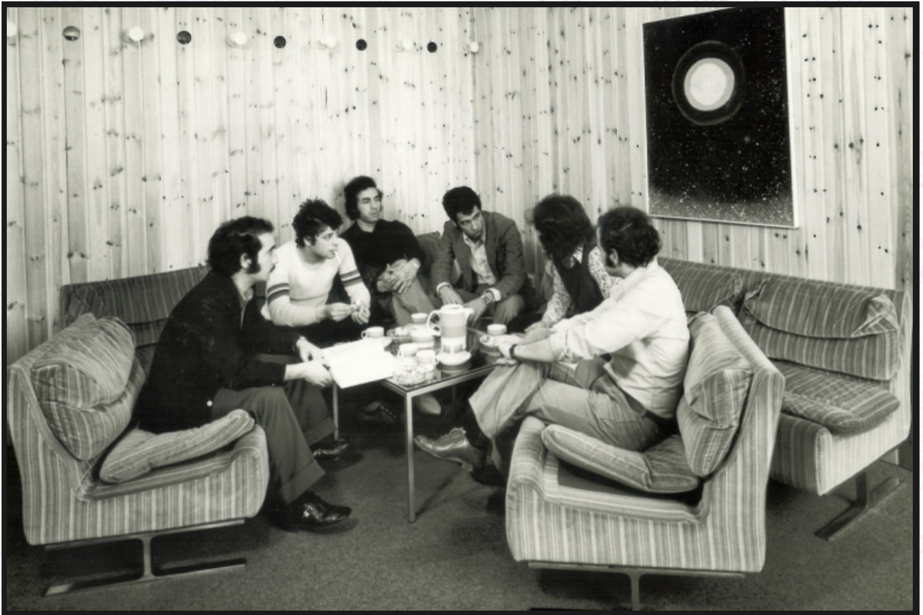
Students hanging out on the UNO-Munich program in 1973. Social activities have always been a highlight of student life!