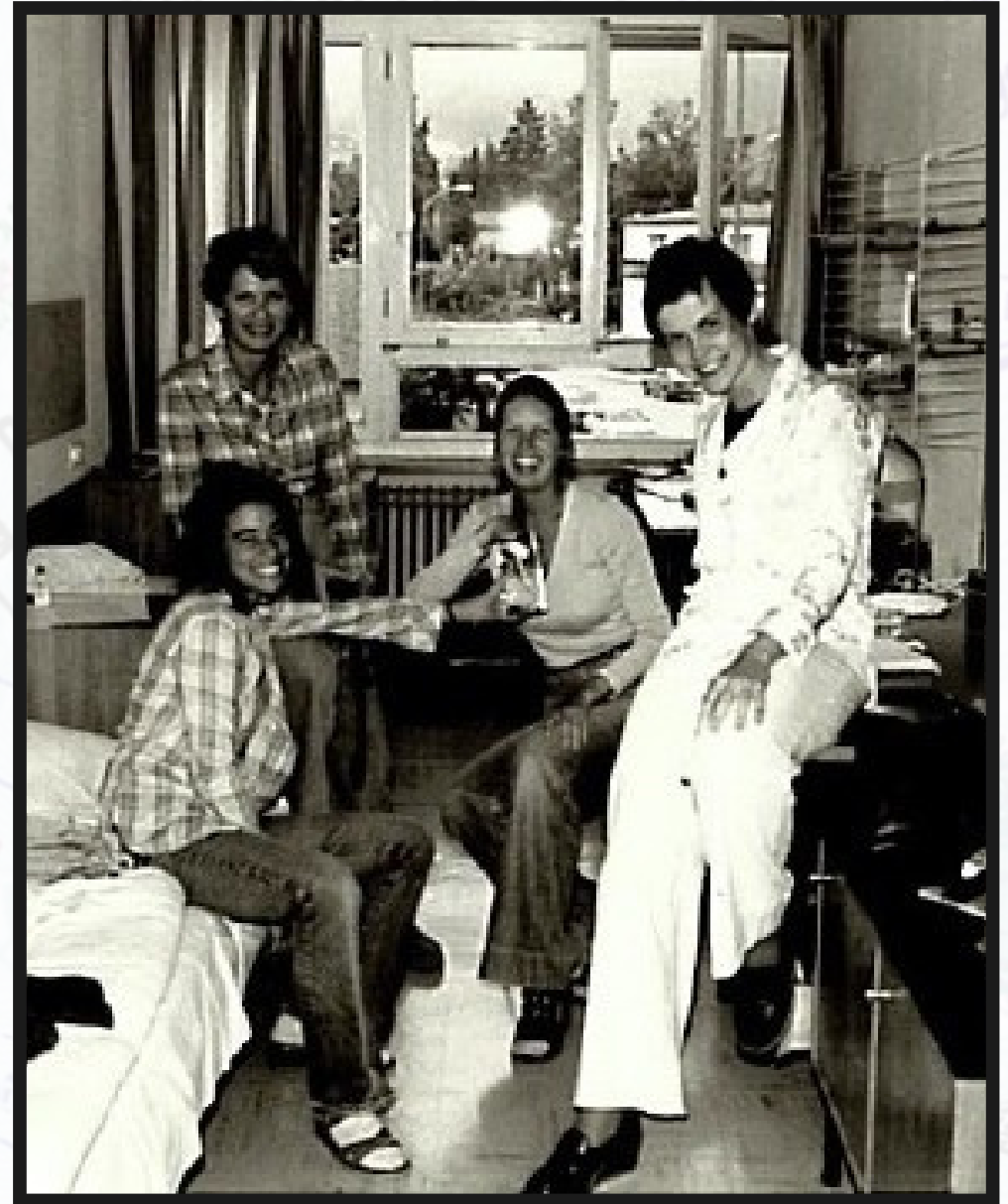
Students in Innsbruck made the Internationales Studentenhaus their home for six weeks. They shared dorm rooms and spent a lot of hours out in the courtyard listening to music and catching some rays.