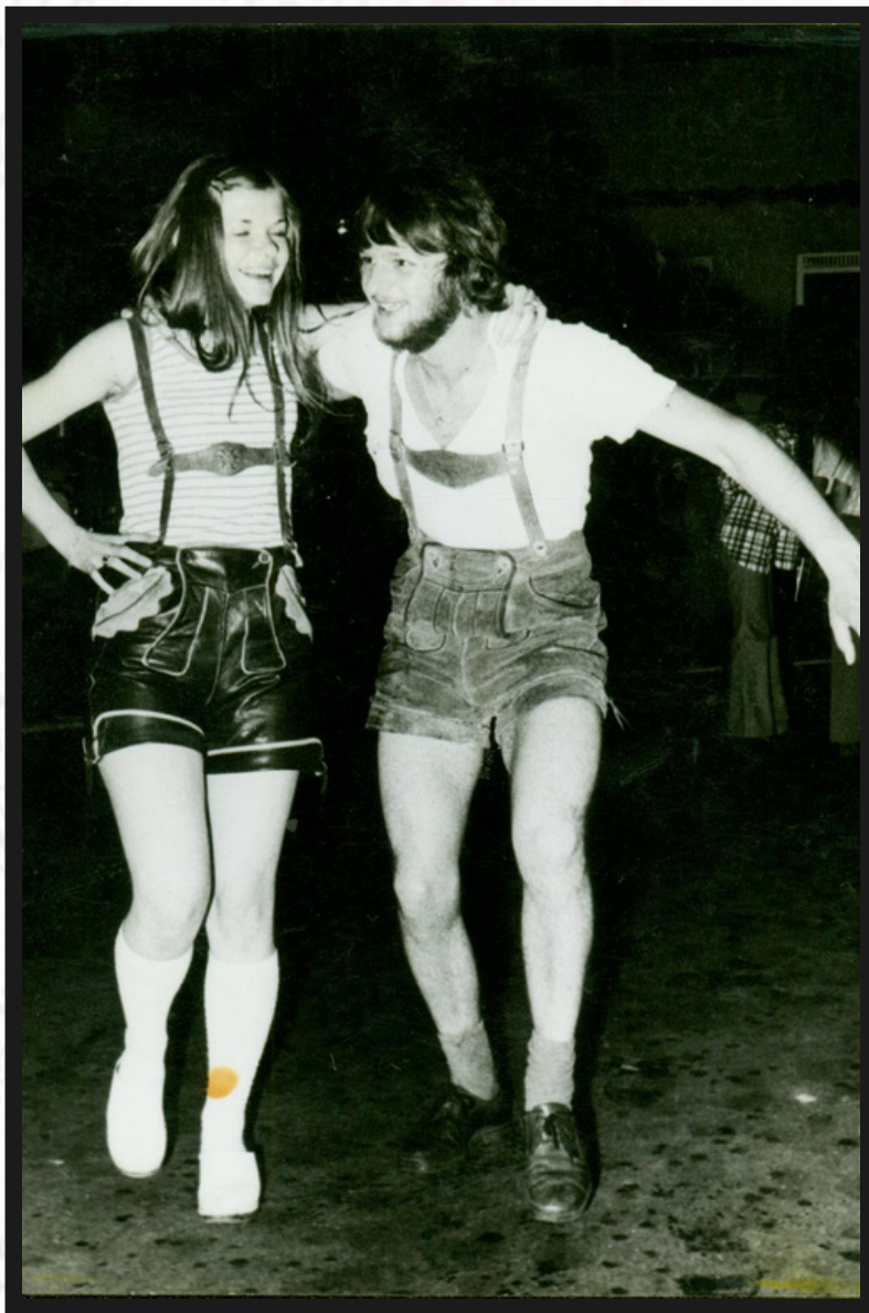
For many years, the Austrian Schuhplattler dancers entertained UNO-Innsbruck students at opening parties in the village of Igls.