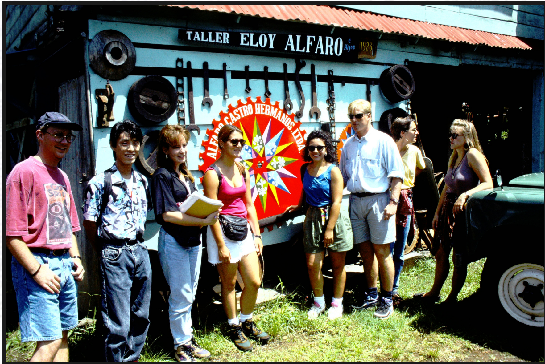
UNO offered a popular summer program in Costa Rica from 1993-2017 that allowed students to live with local families in San Ramón. Here the students are visiting Sarchi, a popular destination for artisan crafts.