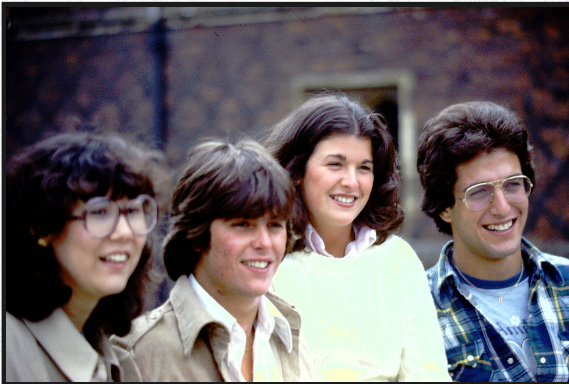
Some of the most memorable moments were on field trips to Venice, Italy.