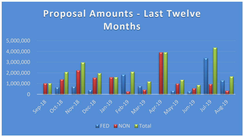
NOTE: Removed Medicaid amount ($111,576,092.40) from October 2018