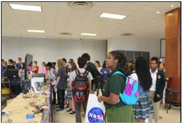
AMRI graduate students show off materials science models and properties with local New Orleans high school students.

UNO" event. The event was held September 22-24, 2016 and hosted over 1,500 local area students in grades 6-12 and undergraduate students, as well as the general public. The Mars Rover Curiosity was displayed as a half scale model and many tables had interactive STEM activities to stimulate interest in the sciences and supplement the viewing. The Curiosity is one of two models in the world and this event was the first showing in Louisiana.