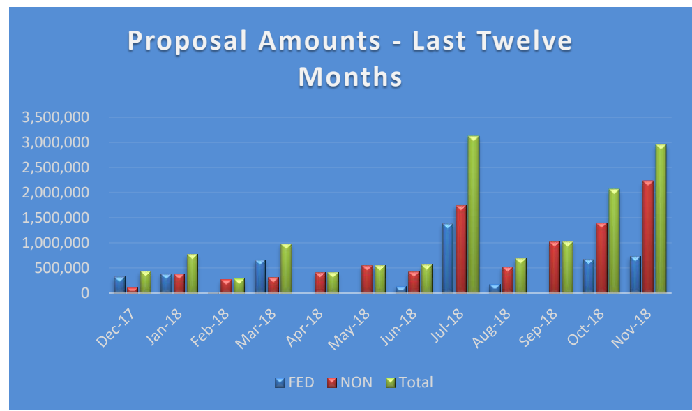
NOTE: Removed Medicaid amount ($111,576,092.40) from October 2018