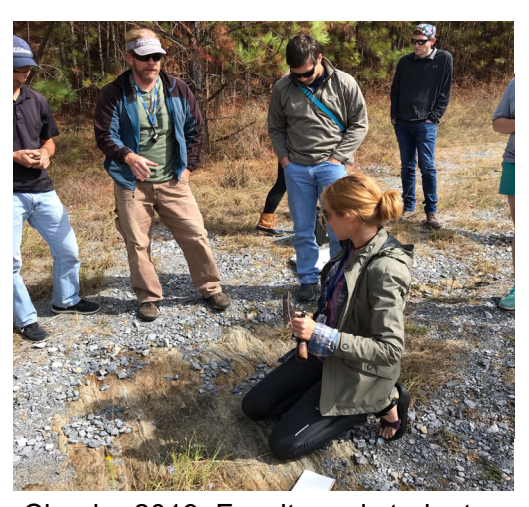
Cheaha 2019: Faculty and students discussing the significance of the Wetumpka impact crater in Wetumpka Alabama during the fall