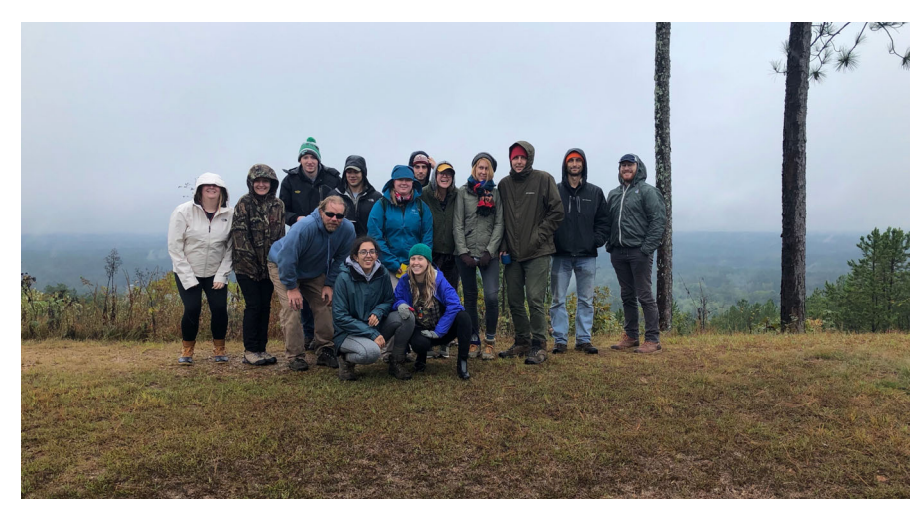
Students of the 2019 structural geology trip in some nasty weather at the top of Mt. Cheaha Alabama. Notice that you can just barely see the Blue Ridge lithotectonic province in the distance.