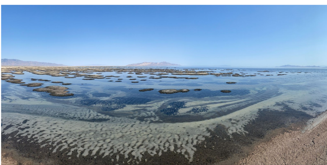
Microbialite mounds in the south arm of the Great Salt Lake, Utah. Foreground shows rippled oolitic sands and microbialite rollers (similar to oncolites).