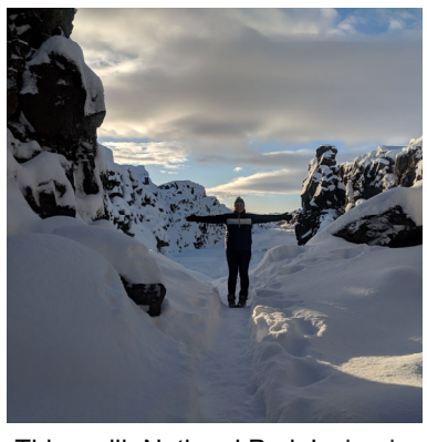
Thingvellir National Park Iceland Mid-Atlantic Ridge Rift Valey boundary between North

Favorite Mineral: Tourmaline Favorite National Park: Big Bend National Park Favorite Geologist: James Hutton