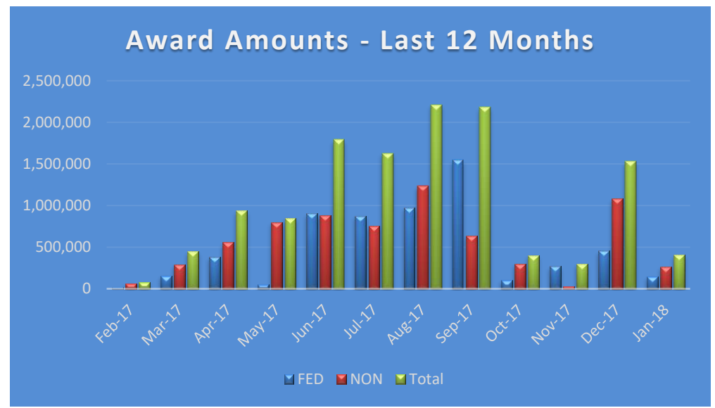
NOTE: Removed Medicaid award amount ($26,882,016) from June 2017