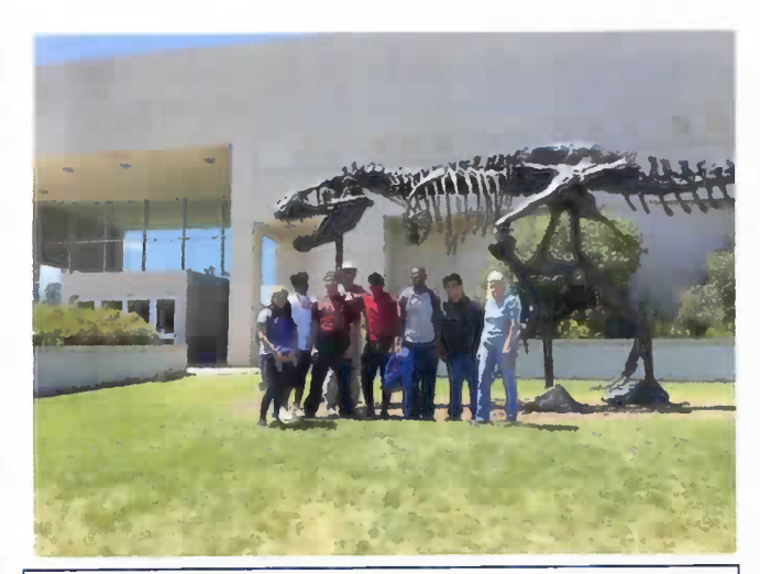
Our group at the Museum of the Rockies, Bozeman, MT.