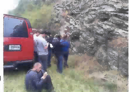
Field trip to Mt Cheaha State Park in Alabama

field all at once. We still have approximately 2 weeks of fieldwork left to complete the project and are hurriedly trying to wrap things up before the winter cold fronts really limit our ability to be on the water. I hope that by the time you are reading this the field campaign is complete and we are full steam ahead characterizing the samples in the laborato-